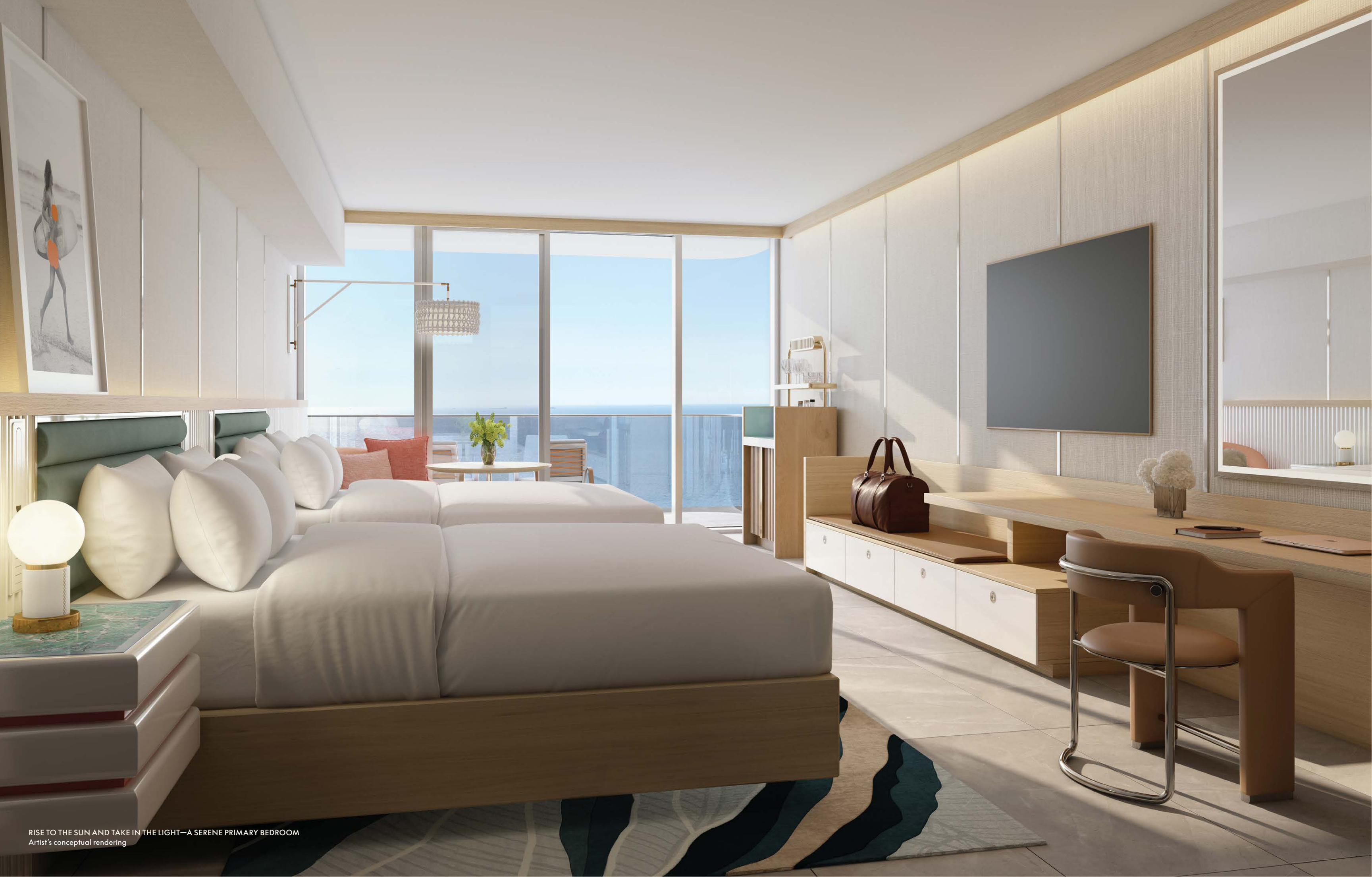
RISE TO THE SUN AND TAKE IN THE LIGHT—A SERENE PRIMARY BEDROOM Artist's conceptual rendering