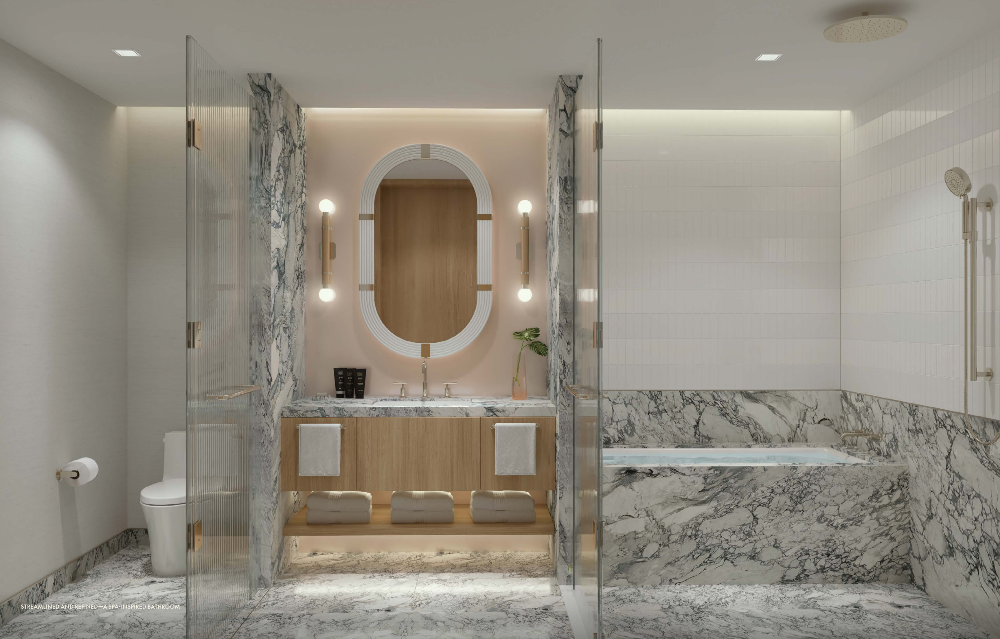
STREAMLINED AND REFINED—A SPA-INSPIRED BATHROOM