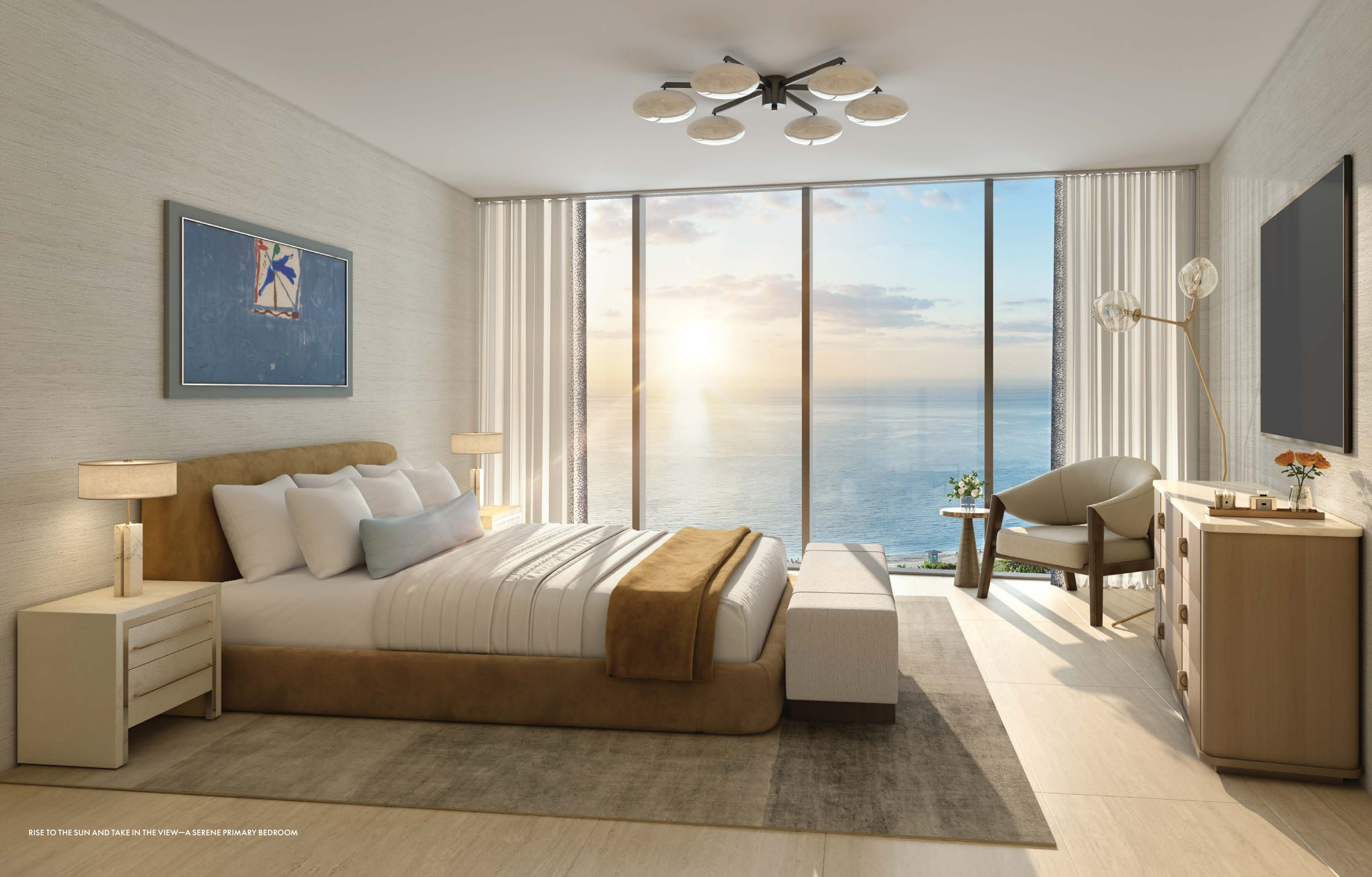
RISE TO THE SUN AND TAKE IN THE VIEW—A SERENE PRIMARY BEDROOM