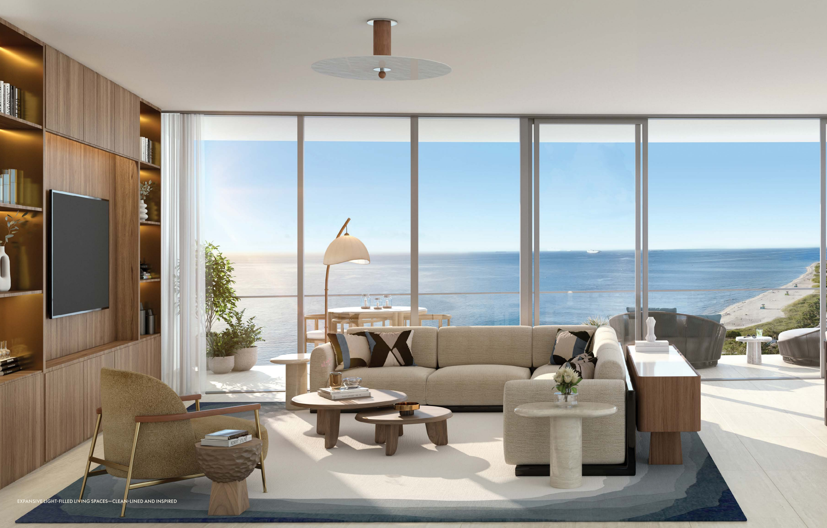
EXPANSIVE LIGHT-FILLED LIVING SPACES—CLEAN-LINED AND INSPIRED